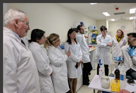
Lab tour (at all 3 institutes)