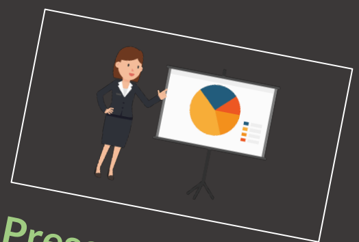
Presentations by experts in the field

Get to know top-notch research and facilities in our partner institutes and receive hands-on training from the experts in the RM field.